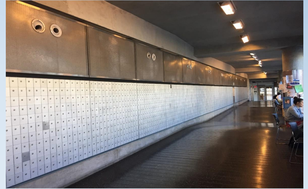
Current 200, 300, and 400 Level Central Space Arrangements