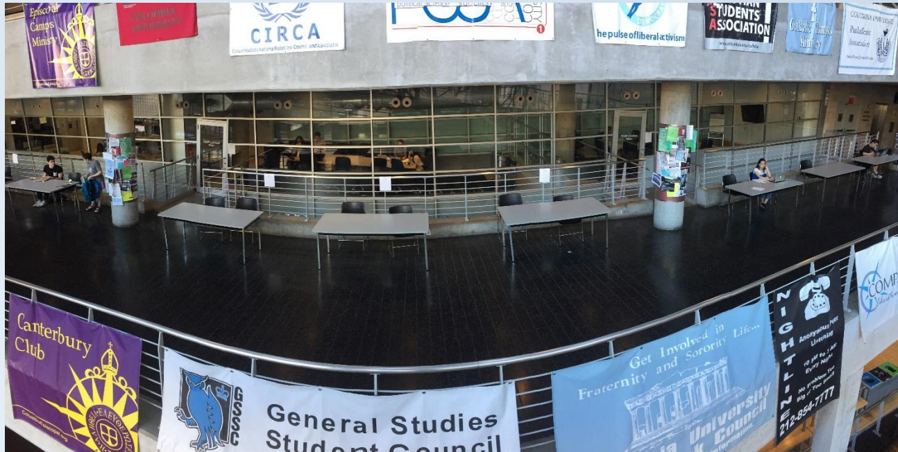
200 Level Ramp Lounges