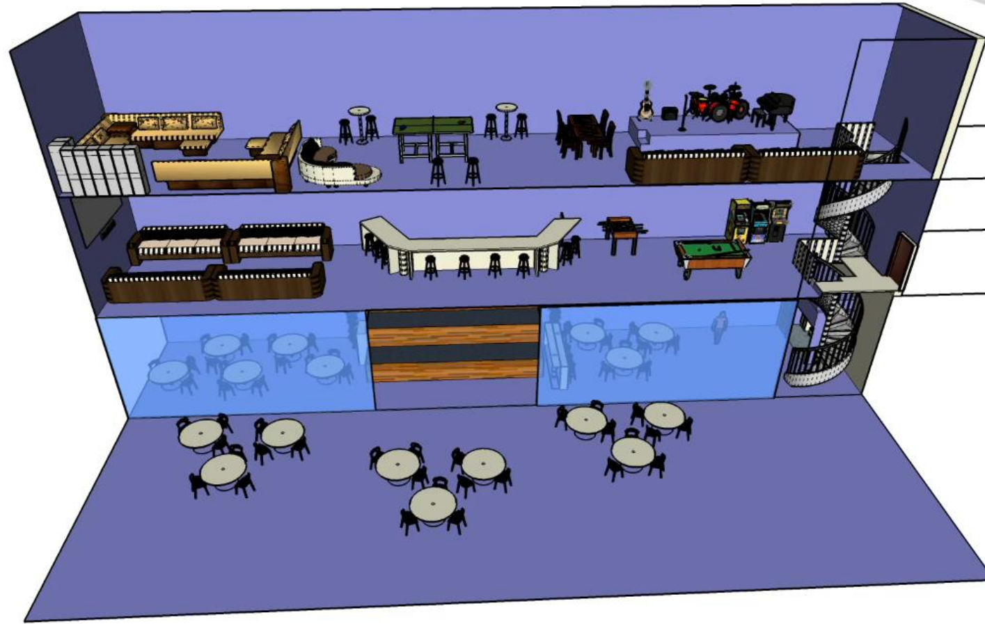
Virtual Walkthrough of Envisioned Central Student Lounge